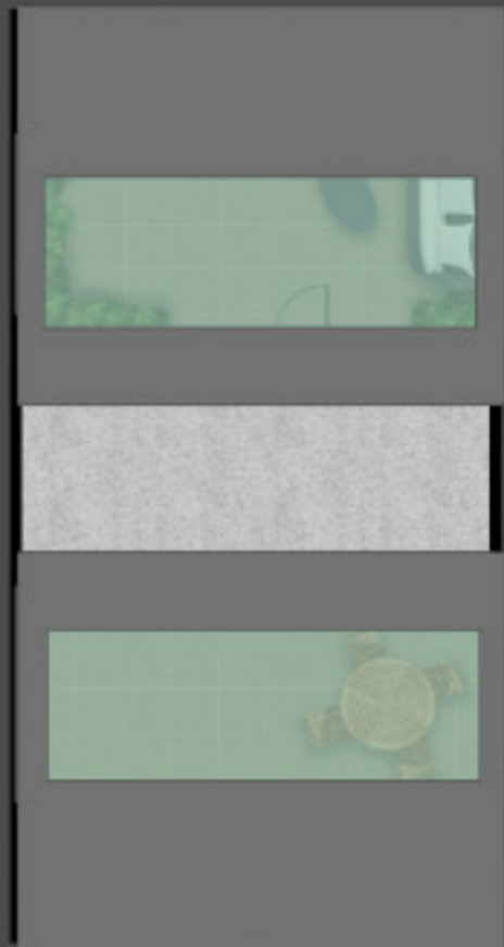
ROOF FLOOR PLAN 2