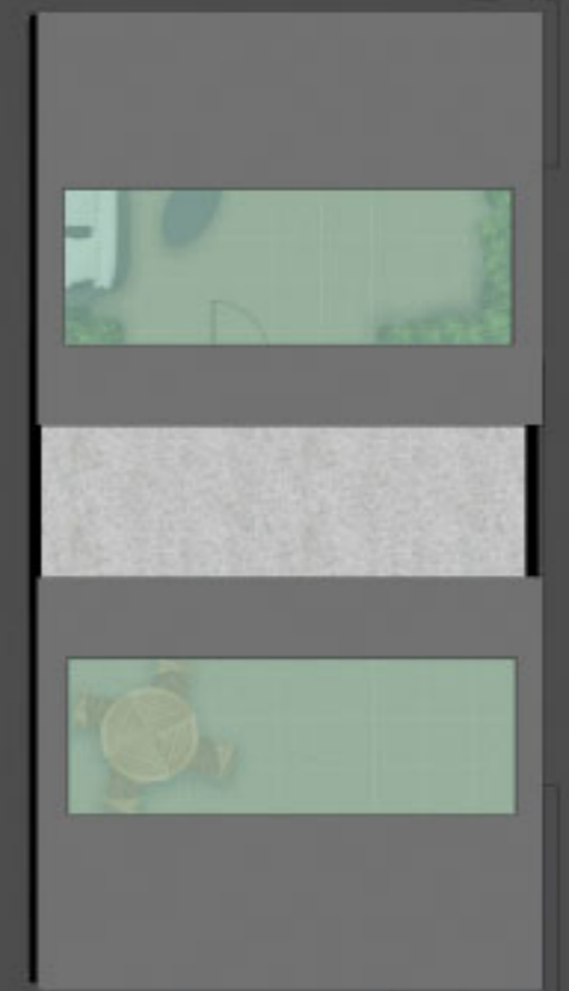
ROOF FLOOR PLAN 2