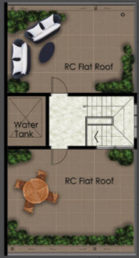
ROOF FLOOR PLAN 1