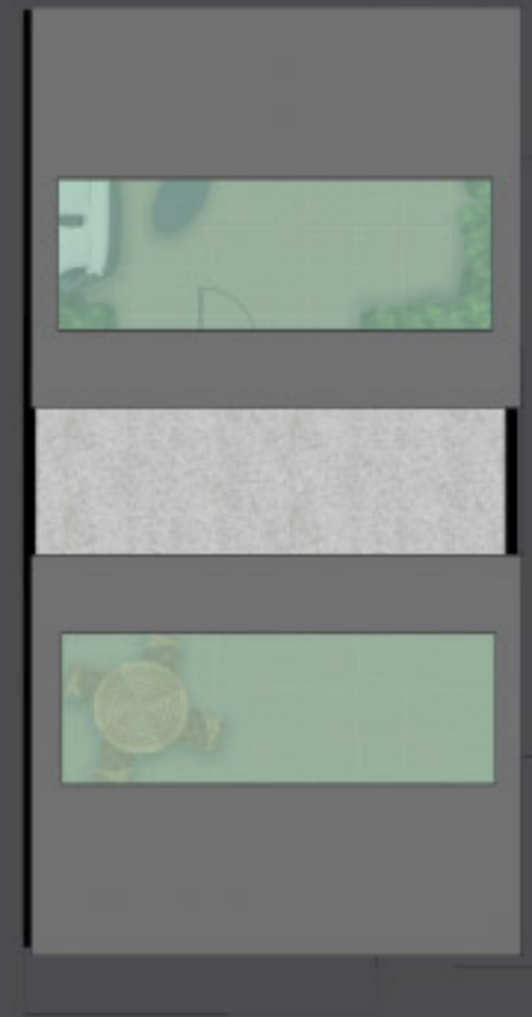
ROOF FLOOR PLAN 2