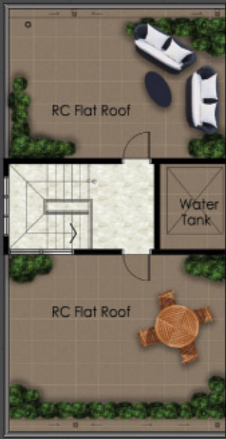
ROOF FLOOR PLAN 1