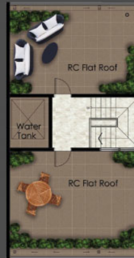
ROOF FLOOR PLAN 1